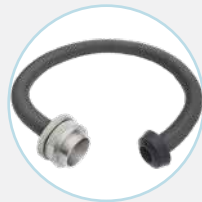
FLOATING BLEEDER HOSE R 4" 60439