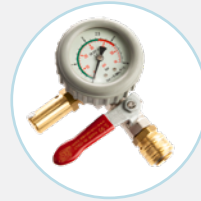
SINGLE FITTING CONTROLLER, 2.5 bar (36 psi) 60310 1.5 bar (22 psi) 74609 1.0 bar (15 psi) 74653