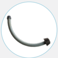
FLOATING BLEEDER HOSE R 1" 60446