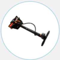
HAND OPERATED PUMP 60010