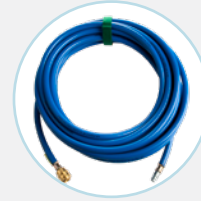
INFLATION HOSE 8 mm I.D. WITH QUICK ACTION COUPLING TO FILL THE PIPE 5 m (16.4') 76684