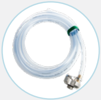
ADAPTER, STORZ D TEST AND MEASURING HOSE, 6 m (19.7') 60407