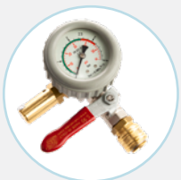
SINGLE FITTING CONTROLLER, 2.5 bar (36 psi) 60310 1.5 bar (22 psi) 74609 1.0 bar (15 psi) 74653