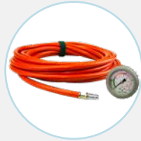
MEASURING HOSE WITH NIPPLE AND GAUGE, RED 0-0.6 bar (0-9 psi), 10 m (33') 78070