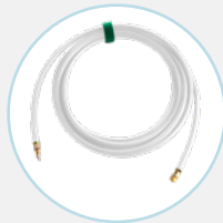
INFLATION HOSE, TRANSPARENT, 5 m (16.4'), 78905