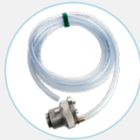
ADAPTER, STORZ C TEST AND MEASURING HOSE, 6 m (19.7') 60412