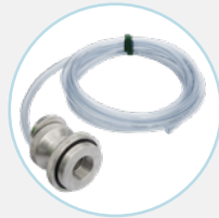
ADAPTER, STORZ A TEST AND MEASURING HOSE, 6 m (19.7') 60438