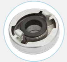
STORZ COUPLING D 60380 C 60388 A 60428