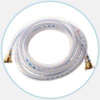
INFLATION HOSE 19 mm I.D. WITH GEKA COUPLING TO FILL THE PIPE 5 m (16.4'), 60452