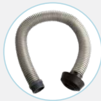
FLOATING BLEEDER HOSE R 2" 60448