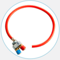
ADAPTER R1", 2x QUICK ACTION COUPLING 60449