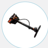
HAND PUMP 0.8 kg (1.8 lbs) 60010