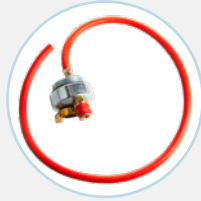
ADAPTER R2", WITH GEKA COUPLING, AND QUICK ACTION COUPLING 60450