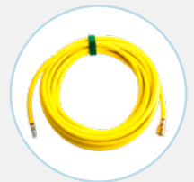
INFLATION HOSE, YELLOW 10 m (33') 76686